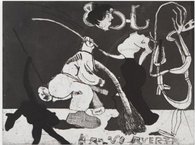
Paula Rego La Mano Muerta, 1962/64 Etching. Image: 19.5 x 29.5 cm. Paper: 38 x 47 cm. Published by the artist in 2020 from a plate drawn in 1962/64 in an edition of 50. Courtesy Paula Rego and Cristea Roberts Gallery, London © Paula Rego